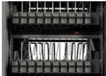
Power brick lacing stores power bricks easily and neatly (medium- and large-shelf models only).