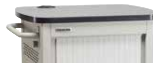
Laminate top provides extra working space.