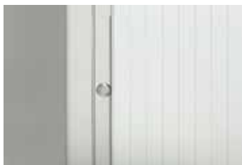
Sliding, "pinchless" door saves space.