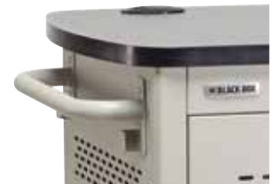
Durable push/pull bar and power cord wrap.