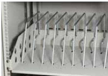
Rackmounted shelf with rolled stainless steel device slots that help prevent scratches.