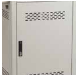
Hinged door with handle.