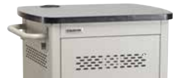
Laminate top provides extra working space.