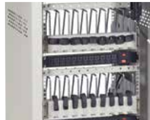
Cable managers open easily for fast cable routing.