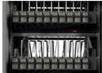
Power brick lacing stores power bricks easily and neatly (medium- and large-shelf models only).