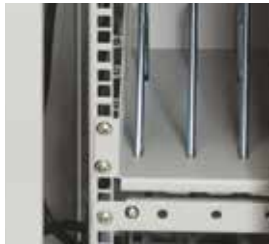
Standard rack mounting allows greater flexibility.