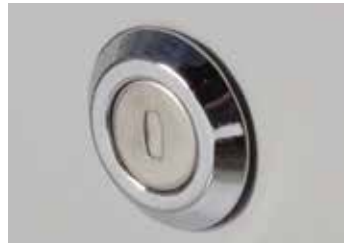
Locking rear access panel.