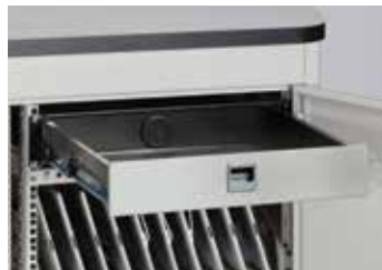
Optional drawers and shelves available.