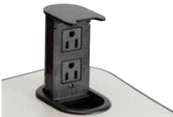
Optional integrated pop-up power port for maximum safety.