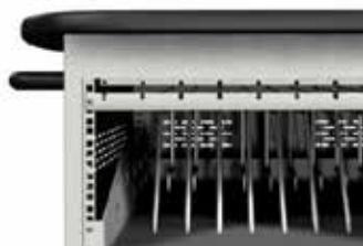
Two-piece cable managers open easily for fast cable routing.