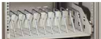
Rackmounted shelf with rolled stainless steel device slots that help prevent scratches.