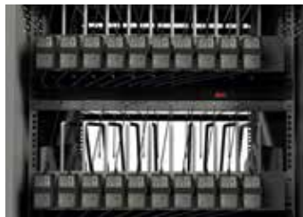
Power brick lacing stores power bricks easily and neatly (medium- and large-shelf models only).