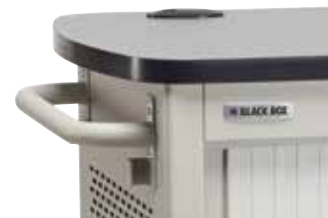
Durable push/pull bar and power cord wrap.