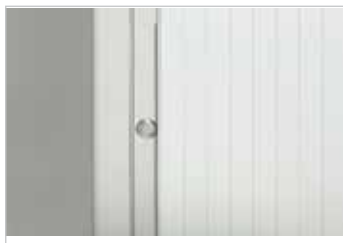
Sliding, "pinchless" door saves space.