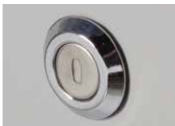
Locking front door and rear access panel.