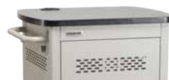
Laminate top provides extra working space.