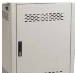
Hinged door with handle.