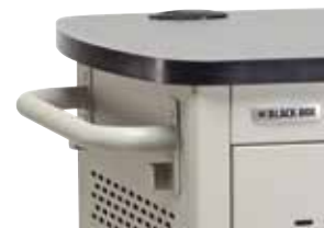
Durable push/pull bar and power cord wrap.