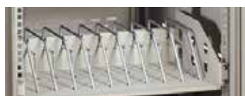
Rackmounted shelf with rolled stainless steel device slots that help prevent scratches.