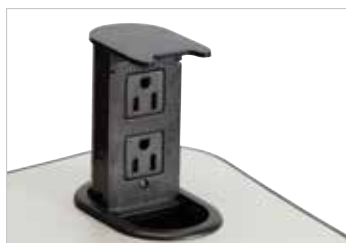
Optional integrated pop-up power port for maximum safety.