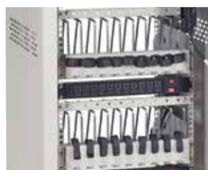
Two-piece cable managers open easily for fast cable routing.