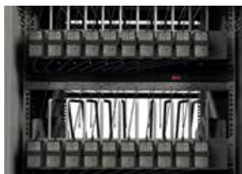
Power brick lacing stores power bricks easily and neatly (medium- and large-shelf models only).