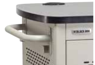
Durable push/pull bar and power cord wrap.