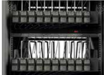
Power brick lacing stores power bricks easily and neatly (medium- and large-shelf models only).