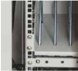
Standard rack mounting allows greater flexibility.