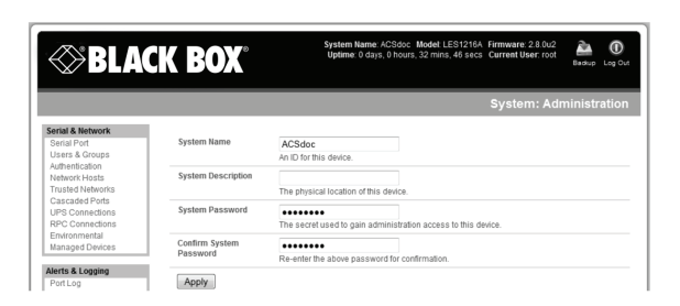
Figure 2. System: Administration screen.

• To assign your remote console manager a static IP address or to permanently enable DHCP, select "System: IP" then "Network Interface" and check "DHCP" or "Static" for configuration method.